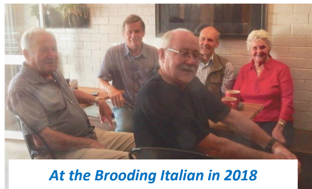
At the Brooding Italian in 2018