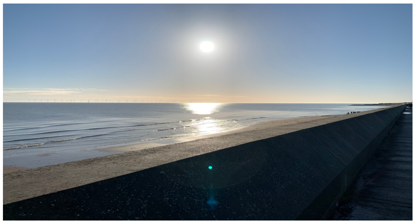
Couldn't resist this lovely sunset on the sea front at Frinton